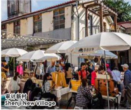
审计新村 Shenji New Village

🏠 Taichung Holiday Inn Express Hotel or similar