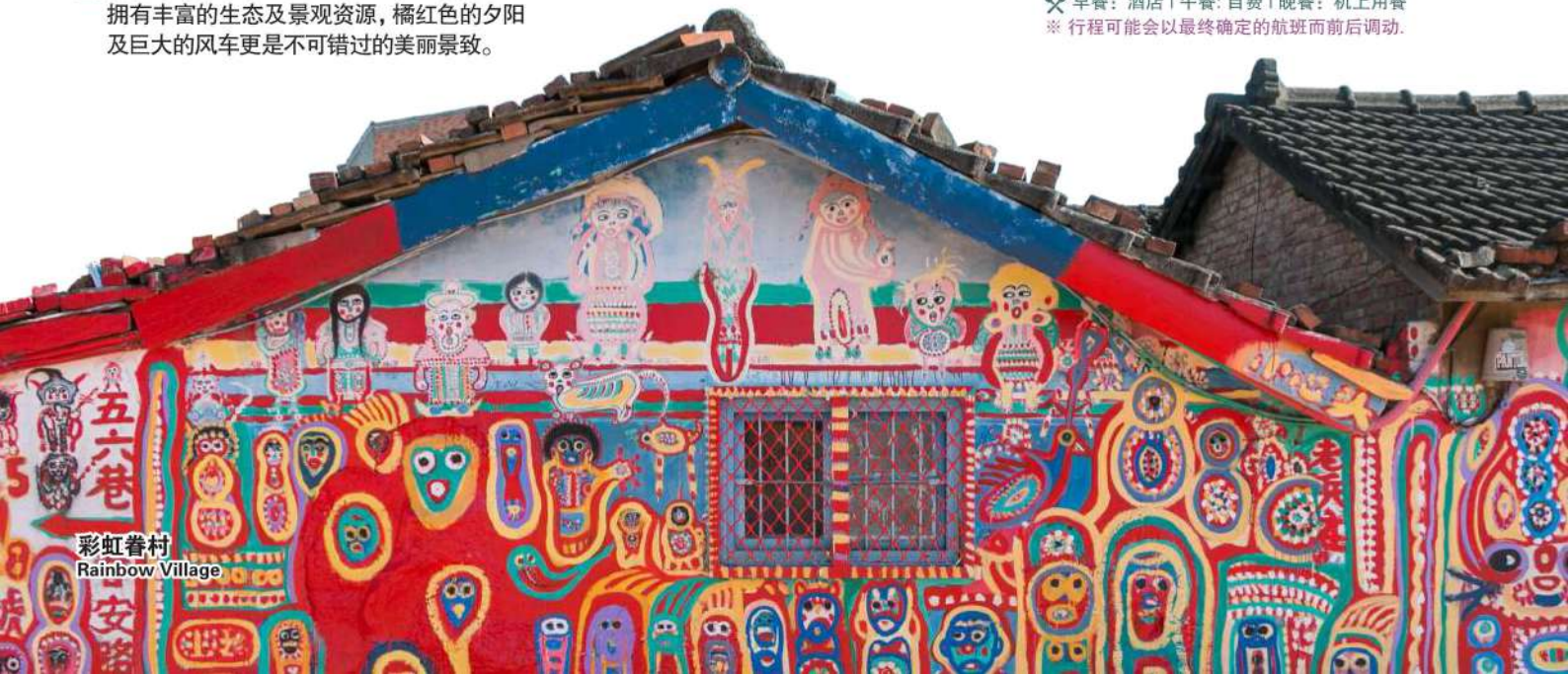
彩虹眷村 Rainbow Village