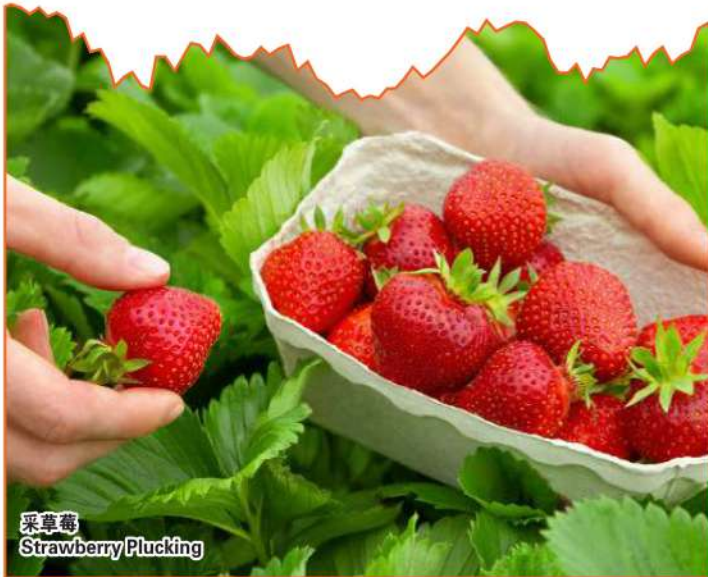
采草莓 Strawberry Plucking

GOURMET: Taiwanese Cuisine | BBQ | Local Specialty | Hakka Cuisine | Steamboat Buffet