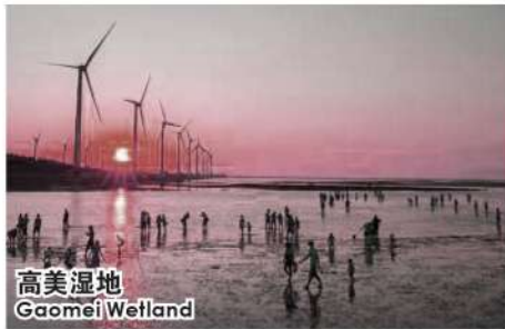
高美湿地 Gaomei Wetland