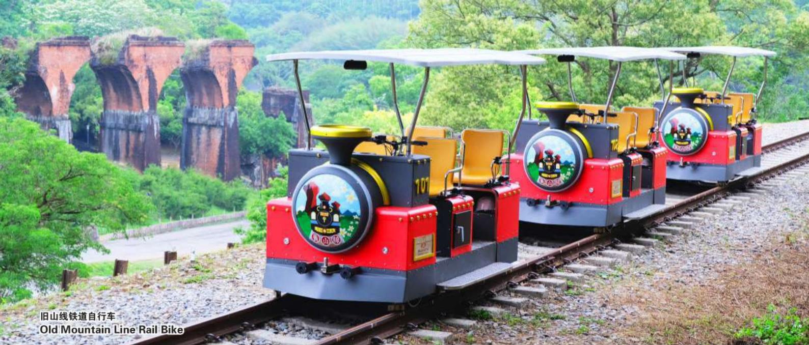
旧山线铁道自行车 Old Mountain Line Rail Bike