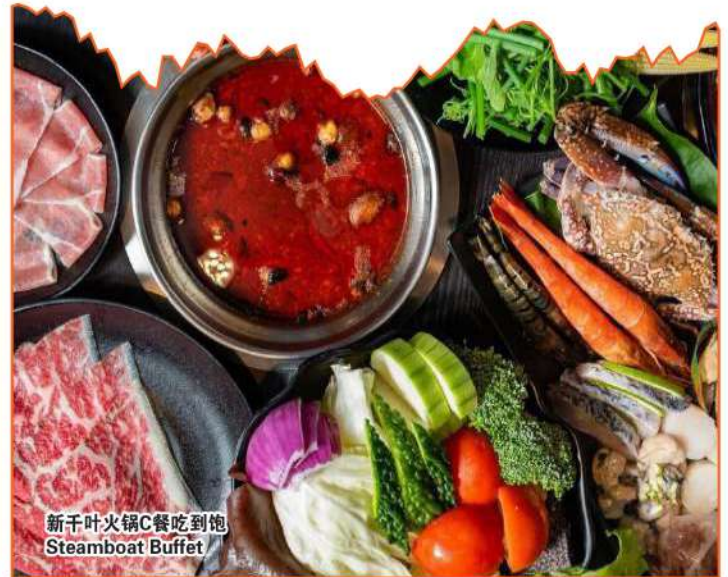
新千叶火锅C餐吃到饱 Steamboat Buffet