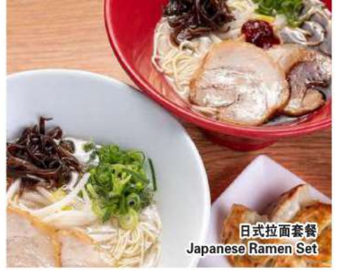
日式拉面套餐 Japanese Ramen Set