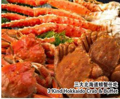
三大北海道螃蟹任吃 3 Kind Hokkaido Crab & Buffet