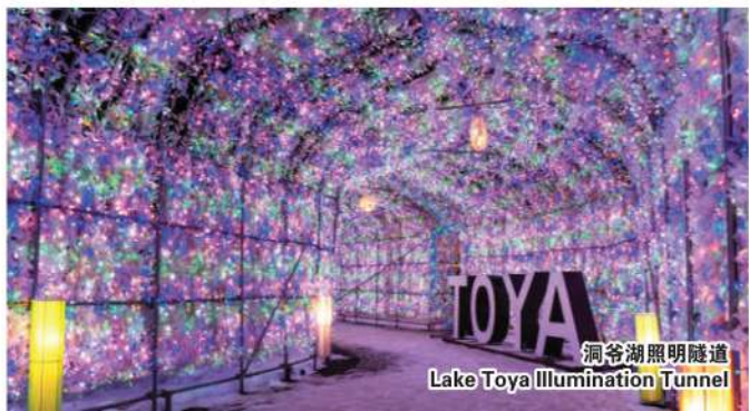
洞爷湖照明隧道 Lake Toya Illumination Tunnel