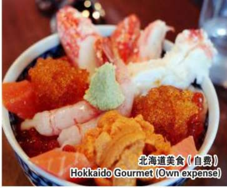
北海道美食 (自费) Hokkaido Gourmet (Own expense)