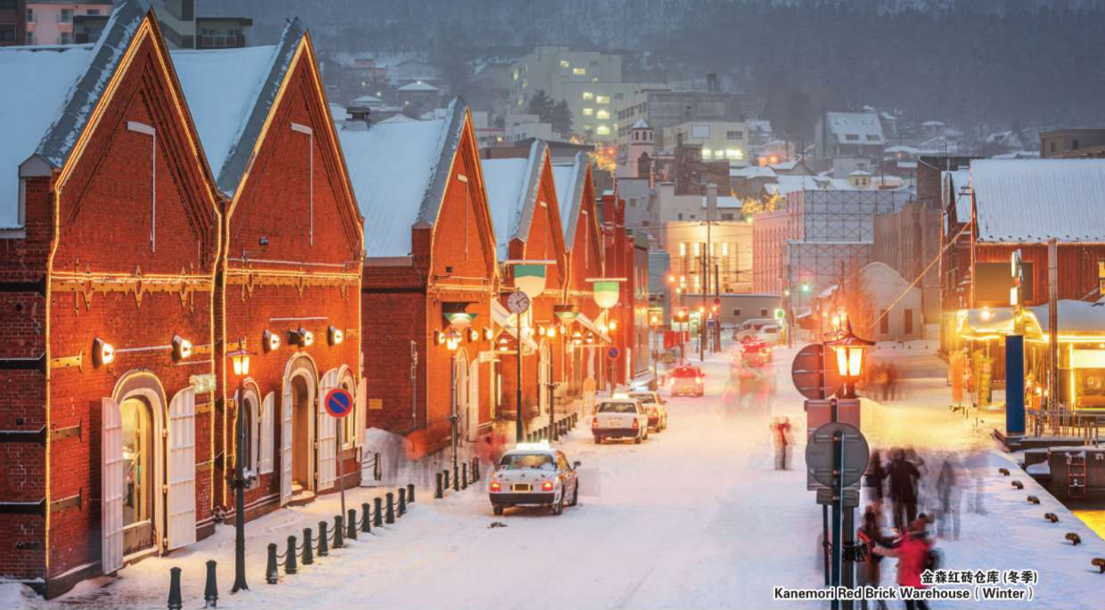
金森红砖仓库 (冬季) Kanemori Red Brick Warehouse (Winter)