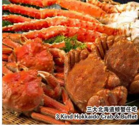
三大北海道螃蟹任吃 3 Kind Hokkaido Crab & Buffet