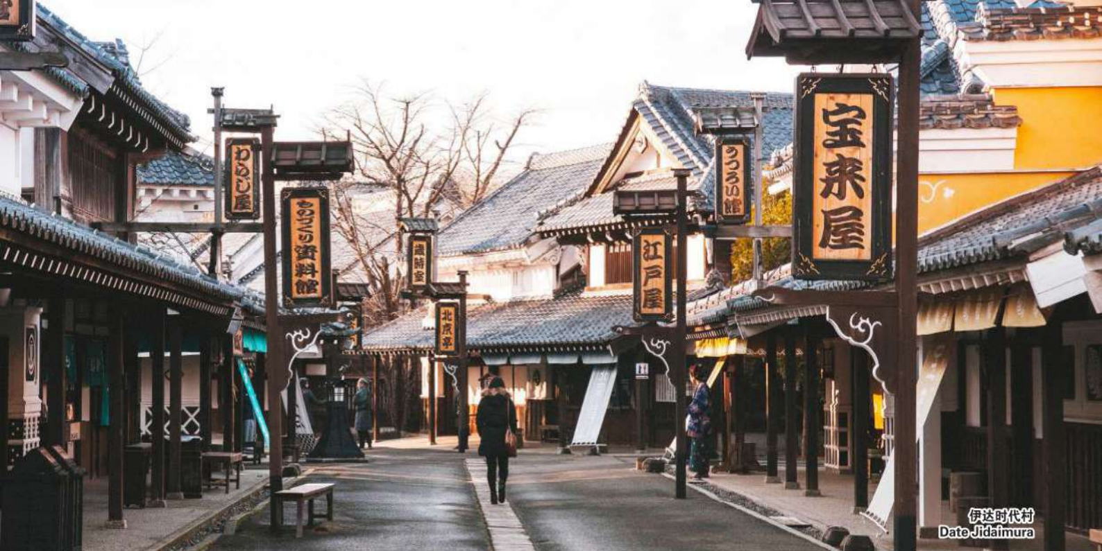
伊达时代村 Date Jidaimura