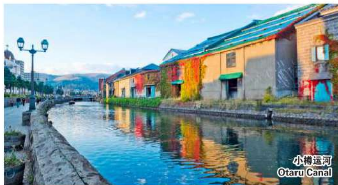
小樽运河 Otaru Canal