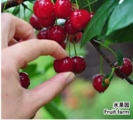
水果园 Fruit farm