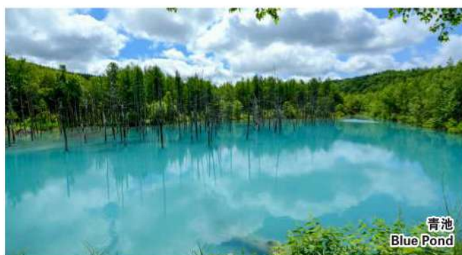
青池 Blue Pond