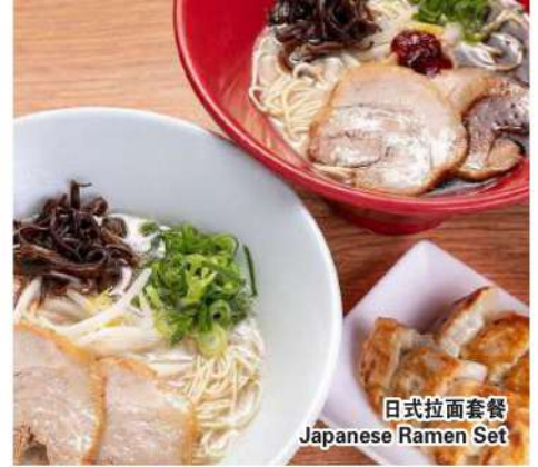
日式拉面套餐 Japanese Ramen Set